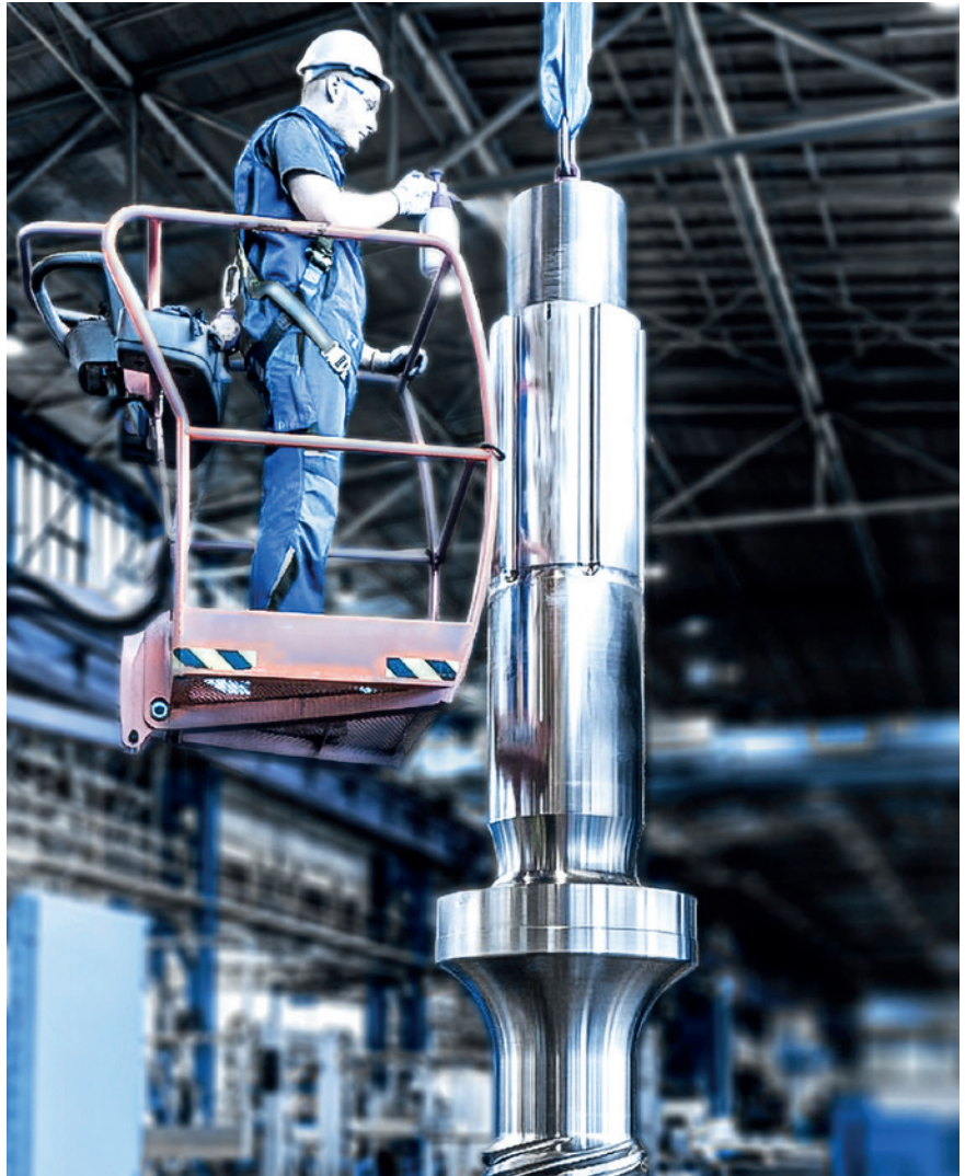
Göppingen Service Center, machining a screw

We also ensure fast delivery from our stock of over 15,000 spare parts. We offer our customers all machining processes from a single source – fast, precise, dimensionally accurate.