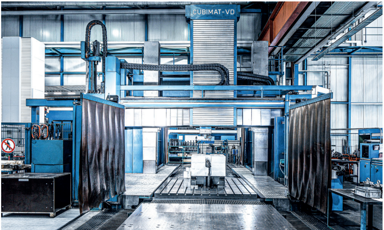
Göppingen Service Center, portal milling machine