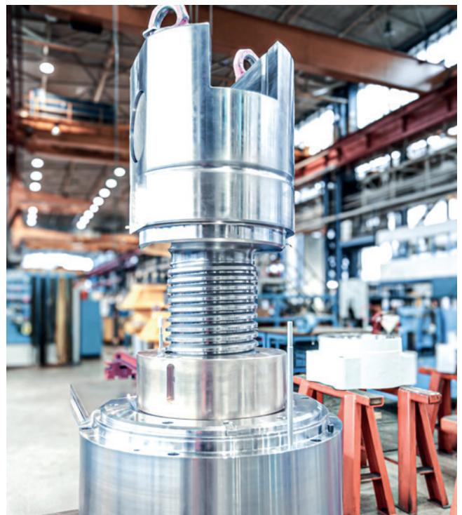
Göppingen Service Center, from top to bottom: flywheel machining, gearwheel correction, pressure point repair